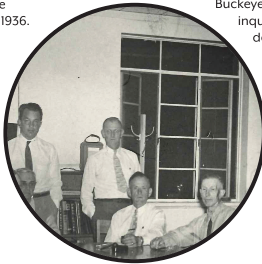
Members of Firelands Electric's Board of Trustees

centers to pay their share, followed by requiring data centers to curtail their load if Buckeye Power's grid operator demands it to protect reliability for existing co-op member-owners. This is one way your electric cooperative is looking out for you.