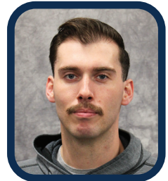
Colt Cross Apprentice Lineman