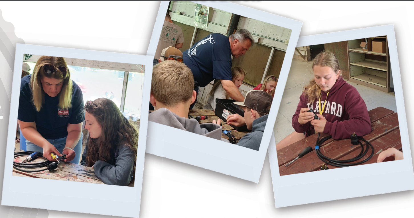
In June, Firelands Electric Co-op employees helped campers at Huron County's 4-H Camp Conger tackle hands-on extension cord projects as part of a longstanding partnership with the camp.