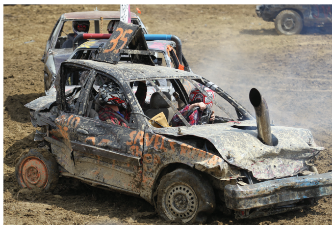
FIRELANDS LABOR DAY FESTIVAL

The annual Firelands Labor Day Festival is a favorite of those in and around the Village of New London. This year's event, scheduled for Sept. 2–5, will be the 113th festival. With activities available for all ages, it is a true family-oriented event, attracting multiple generations of attendees. The traditional parade will take place downtown on Saturday, while the much-loved fireworks display is planned for Monday evening. Truck and tractor pulls, a demolition derby, kids' games, carnival rides, and lots of great food vendors can be found throughout the event. All proceeds from the festival benefit New London's parks system, which provides numerous recreational opportunities for the public throughout the year.