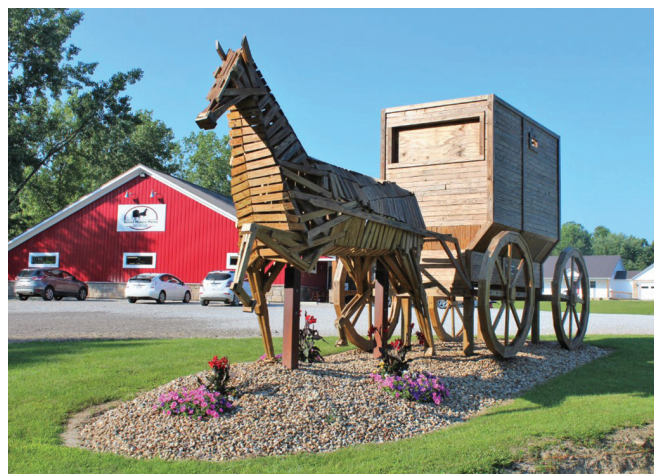
BEYOND MEASURE MARKET