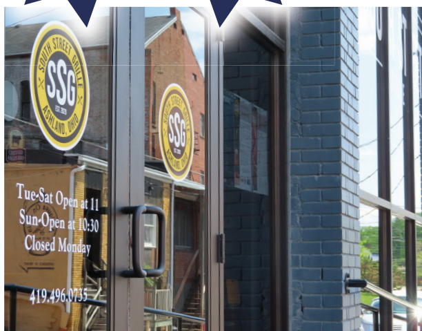
SOUTH STREET GRILLE

While voting was limited to co-op members only, businesses could be located anywhere in the four counties that Firelands Electric serves: Ashland, Huron, Lorain, and Richland. From the perfect pizza to homemade pies and jams, members were not shy about telling us what they love most about their communities. On the next few pages, we spotlight members' top picks. When you're out and about this summer, make sure to check out a few of the best businesses in the area!