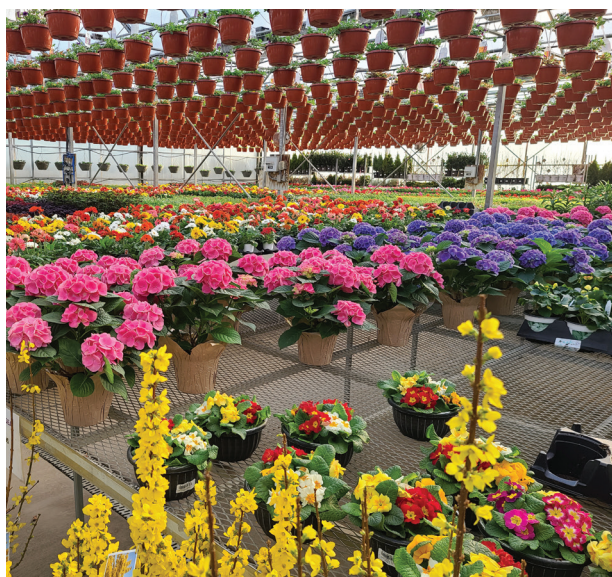
GREEN VALLEY GROWERS

In late 2020, Sean and Carly Little saw their long-time dream of opening a restaurant in their hometown come true. South Street Grille, located on the one-way street just behind Main in downtown Ashland, offers elevated casual dining and a full-service bar. Steaks, ribs, pasta, burgers, vegetarian options, salads, and an extensive kids' menu are just a handful of the many options available on the menu. With a family-friendly main dining floor, basement bar, and large outdoor patio with live entertainment, South Street Grille has something for everyone.