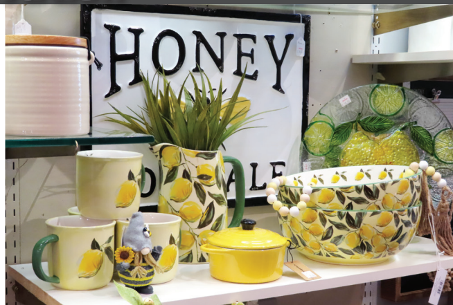
BITTERSWEET GIFT SHOP