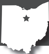
CHIM-CHEROO CHIMNEY SERVICES