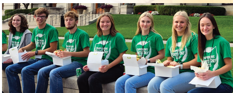
On Oct. 25, students from New London, Black River, and Seneca East high schools joined Firelands Electric and neighboring co-ops Lorain-Medina Rural Electric and North Central Electric for an in-depth look at our state government.

Twenty-six students from Black River High School in Medina County, New London High School in Huron County, and Seneca East High