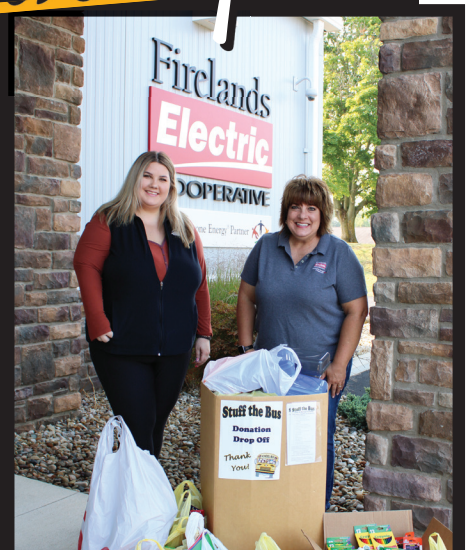
Huron/Erie County Stuff the Bus