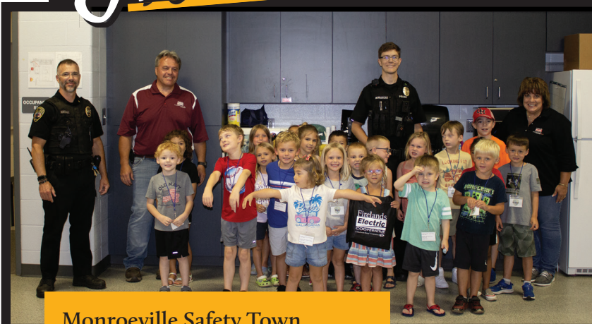
Monroeville Safety Town