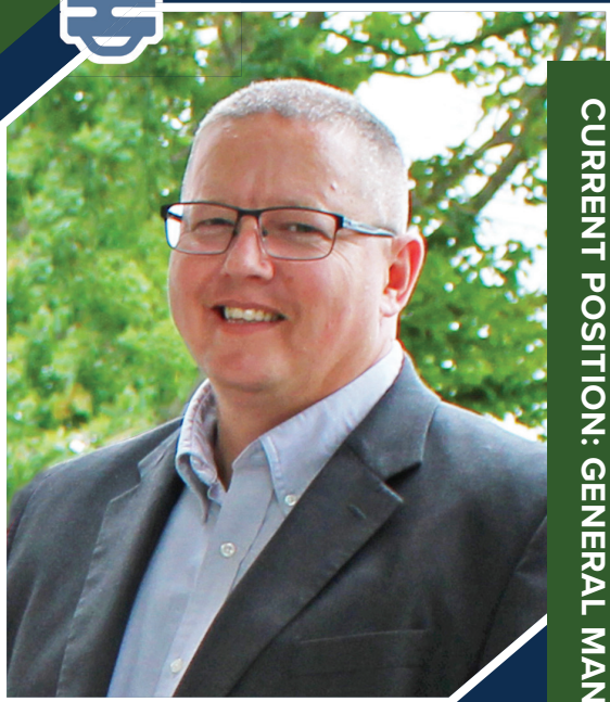
CURRENT POSITION: GENERAL MANAGER