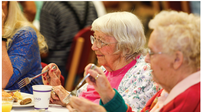
Around 600 members and guests attended Firelands Electric Cooperative's 81st annual meeting and breakfast, held on June 23.

Two major items that accounted for the cooperative's strong financial numbers were high kilowatt-hour sales due to a cold winter and a warm summer, and the employee team holding controllable expenses in check.