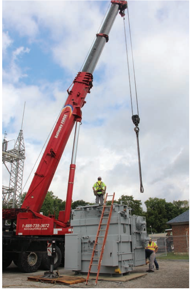
In August, a new 10mVA transformer arrived at Firelands Electric Cooperative. With the assistance of a 250-ton crane, the transformer was permanently placed in the north bay of the New London substation. This unit replaces a 37kVa transformer that was severely damaged when a bird flew into the regulator bushings and caused it to short out. The new transformer will help the cooperative continue to provide reliable service and accommodate future growth to the nearly 1,900 members served by the New London substation.