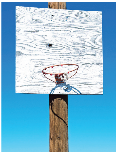
Basketball hoops, deer stands, and other unauthorized items should never be attached to utility poles. They not only create a hazard for linemen, but also cause the poles to deteriorate faster.

Most of us drive by rows of utility poles every day. But how much do we really notice them? These often-overlooked watchmen play an important role in delivering reliable power to the members of Firelands Electric Cooperative. In fact, it takes over 25,800 utility poles to support the nearly 1,000 miles of lines that provide electricity to the more than 9,100 homes and businesses served by the co-op. That's why it's so critical for the co-op to protect and maintain these poles.