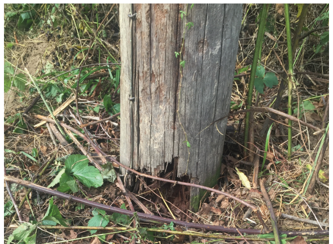
Periodic testing helps Firelands Electric Cooperative identify utility poles that are weak or damaged, like the one shown above. The co-op adds these poles to its work plan so that they can be replaced.

If you have questions or concerns about a Firelands Electric utility pole or a possibly illegal attachment to a pole, contact our Operations Department at 1-800-533-8658 or email operations@firelandsec.com .