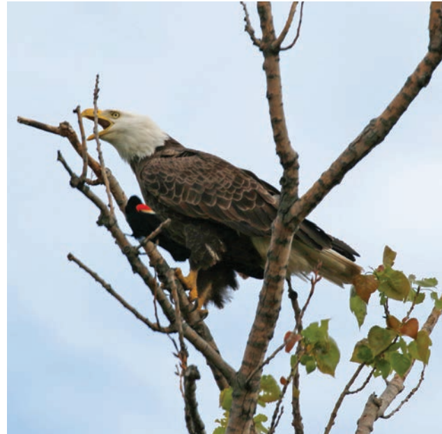
A bald eagle and red-winged blackbird perch atop a tree at Pleasant Hill Lake Park in Perrysville.

W.H. "Chip" Gross ( whchipgross@gmail.com ) is Ohio Cooperative Living's outdoors editor.